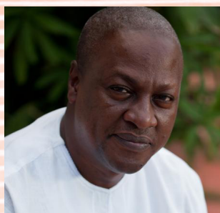
John Dramani Mahama President of Ghana Honorary Patron

Symposia on History, Society, Arts, and Culture & Concert