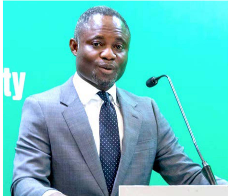
Minister of Health, Kwabena Mintah Akandoh

strengthening deployment to underserved areas,” he said.