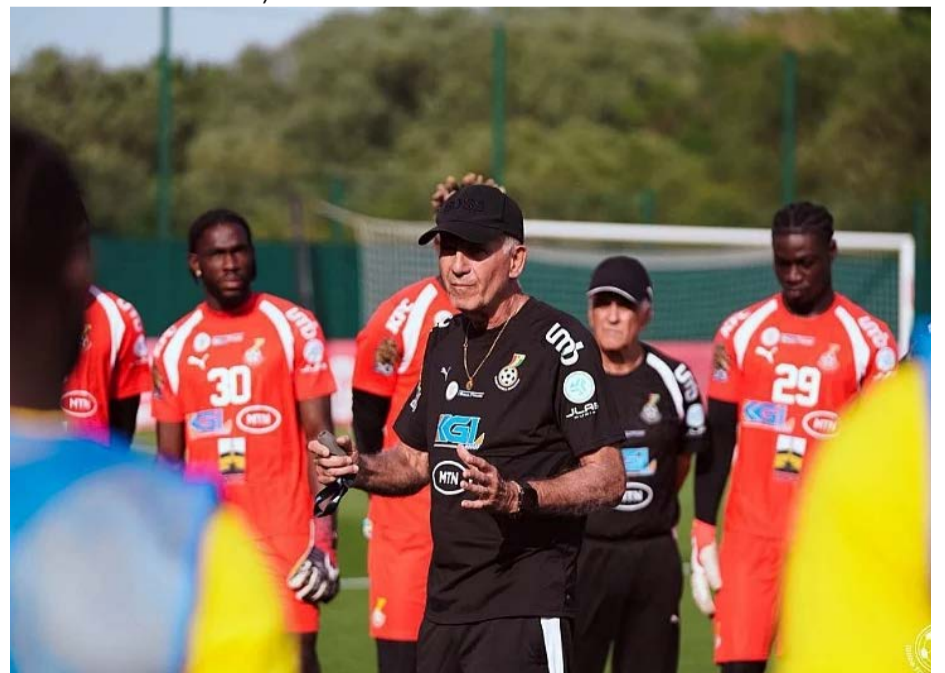
Head coach Carlos Queiroz strategizing with Black Stars players

Queiroz's appointment comes with the expectation of guiding Ghana beyond the group stage for the first time since 2010, after early exits in both 2014 and 2022.