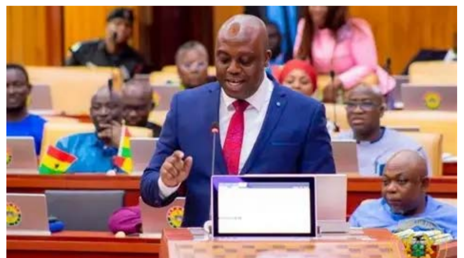
Deputy Minister of Finance, Thomas Ampem Nyarko

He called on stakeholders to support the long-term development agenda, describing it as a blueprint for Ghana's sustainable future.