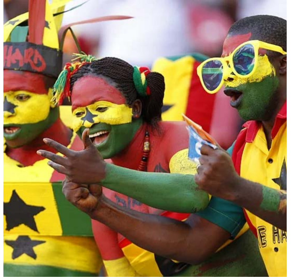
Ghanaian football fans

Under head coach Carlos Queiroz, the Black Stars will be targeting a return to the knockout stages for the first time since 2010, having exited at the group stage in both 2014 and 2022.