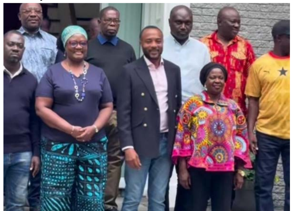
NPP MPs in Canada for capacity building training

According to him, the interaction was highly beneficial, as it helped connect parliamentary work with the lived experiences of Ghanaians abroad, thereby