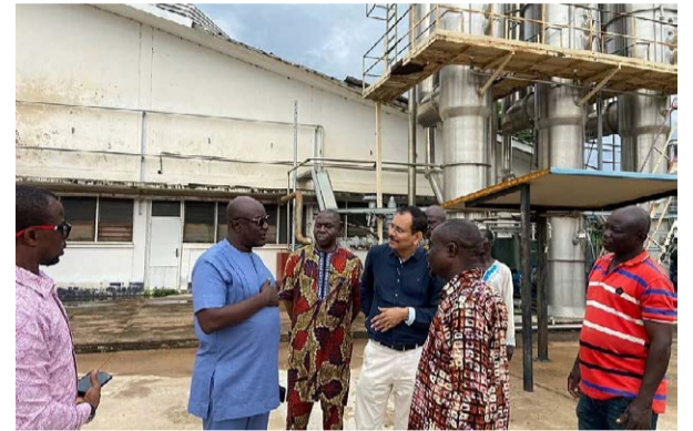
Talensi DCE engages investors