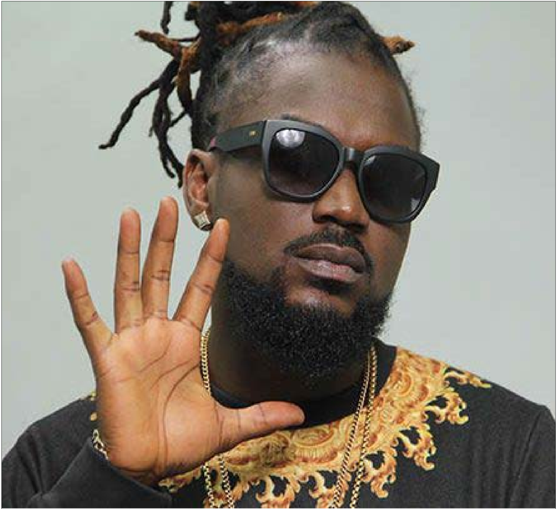
Ghanaian musician, Samini