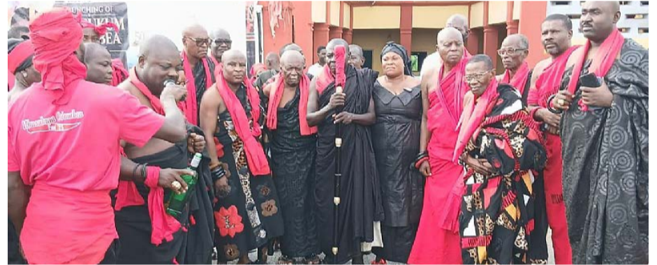
Nkusukum Traditional Council pouring libation