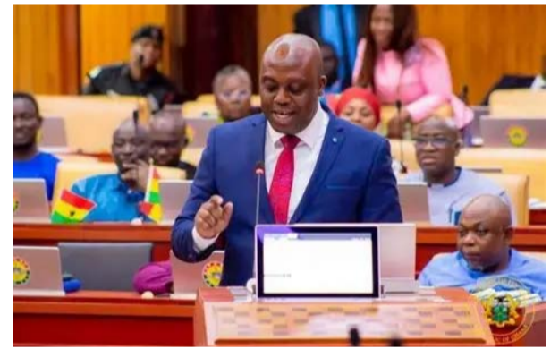
Deputy Minister of Finance, Thomas Ampem Nyarko