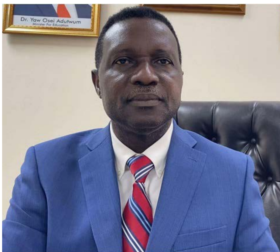
Former Education Minister Dr. Yaw Osei Adutwum

F ormer Education Minister Dr. Yaw Osei Adutwum has attributed the decline in the 2025 West African Senior School Certificate Examination (WASSCE) performance