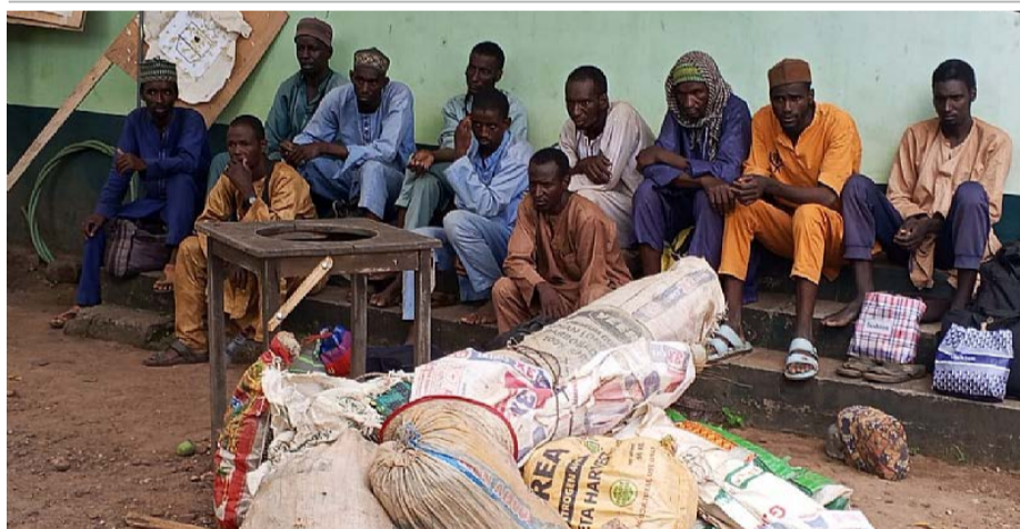
Nigerian nationals intercepted for unlawful entry

The Ghana Immigration Service (GIS) in the Volta Region has intercepted 18 suspected Nigerian nationals, including three children, who entered the country through an unapproved route in the Aflao in the Ketu South Municipality.