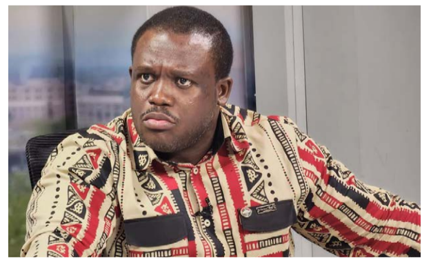
Minister for Communication, Digital Technology and Innovation, Samuel Nartey George

You will be blacklisted for registering SIM cards for others — Sam George