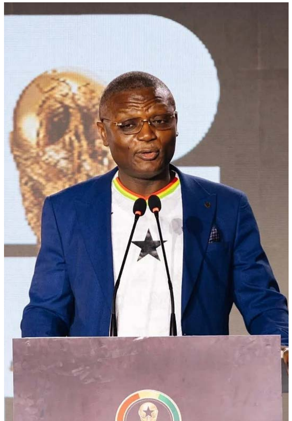
Sports Minister, Kofi Adams

The statement also congratulated the relay team on qualifying for the 2027 World Athletics Championships in Beijing and wished them continued success.