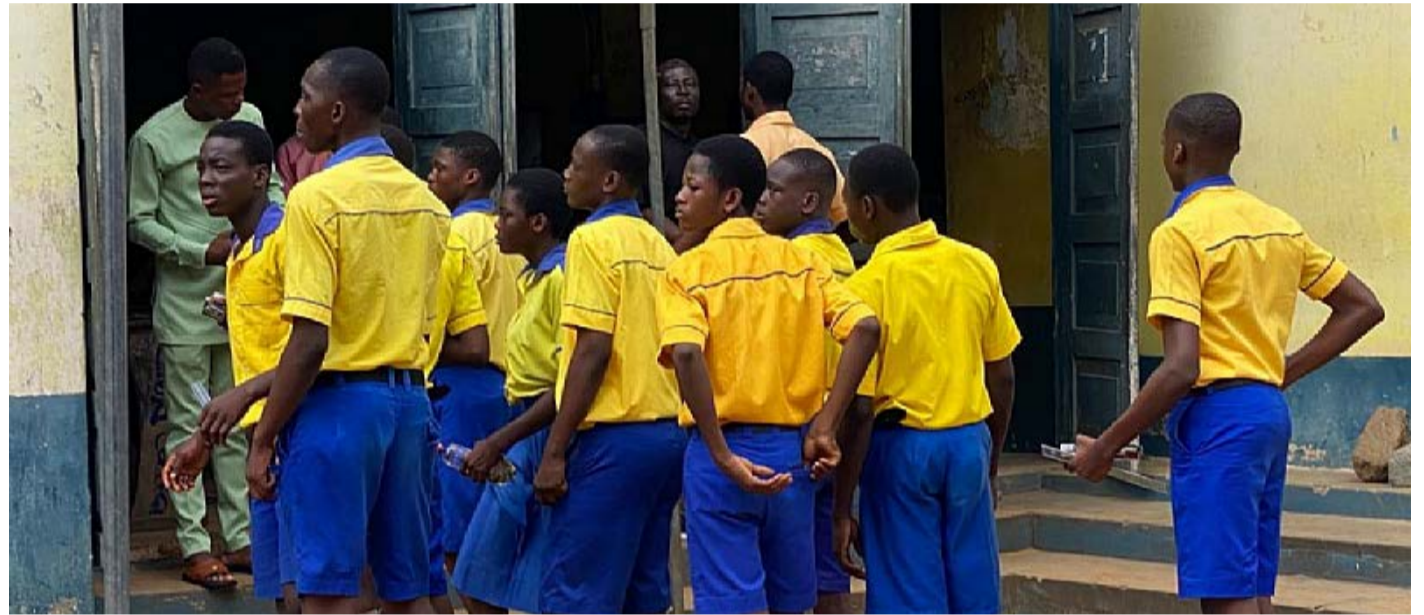
BECE candidates entering the exam hall

The Ghana Education Service in the district has assured all candidates, including those in special circumstances, of the necessary support to enable them to sit the examination under conducive conditions.