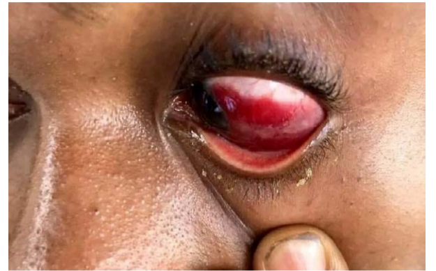
The student with a swollen eye

Amaniampong SHS student allegedly beaten for refusing to attend all-night service