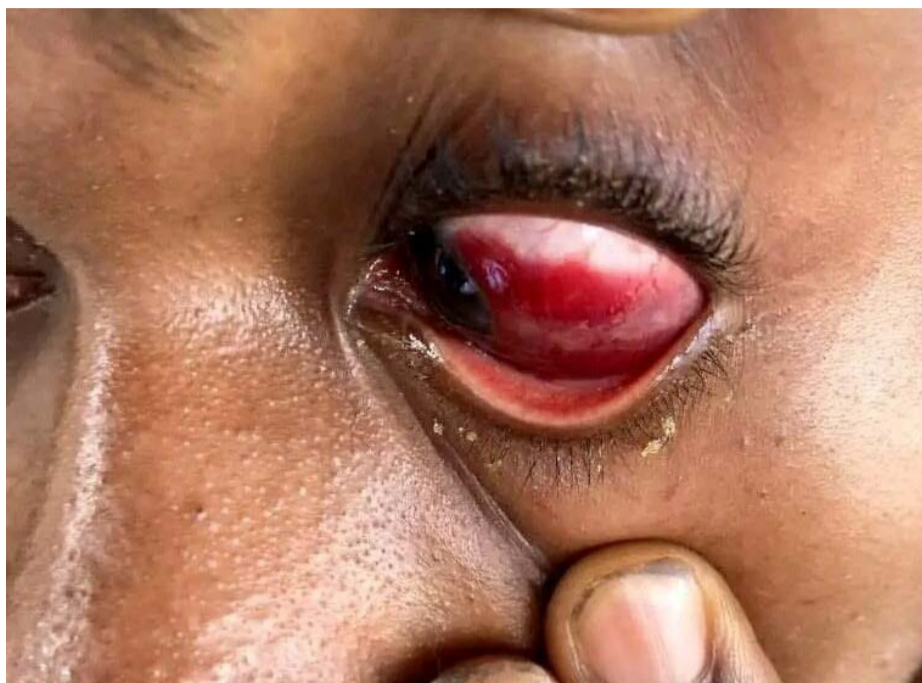
The student with a swollen eye

P olice in Mampong in the Ashanti Region are investigating the alleged assault of a final-year student at Amaniampong Senior High School.