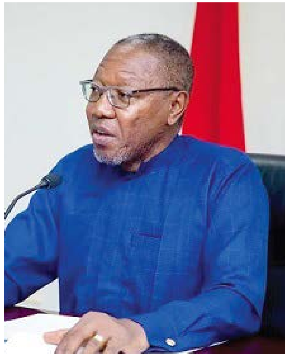
Deputy Minister for Education, Dr. Clement Abas Apaak

The candidates, comprising 304,349 boys and 315,792 girls, are expected to sit for the examination at centres nationwide.