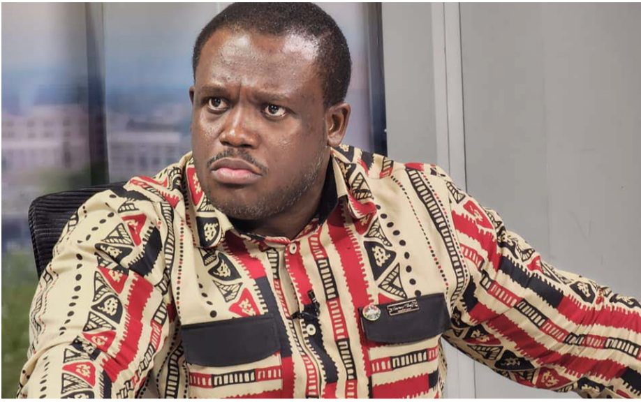
Minister for Communication, Digital Technology and Innovation, Samuel Nartey George

The Minister for Communication, Digital Technology and Innovation, Samuel Nartey George, has cautioned that Ghanaians who register SIM cards on behalf of others could face severe penalties, including being blacklisted from essential public and financial services under a new digital security framework.