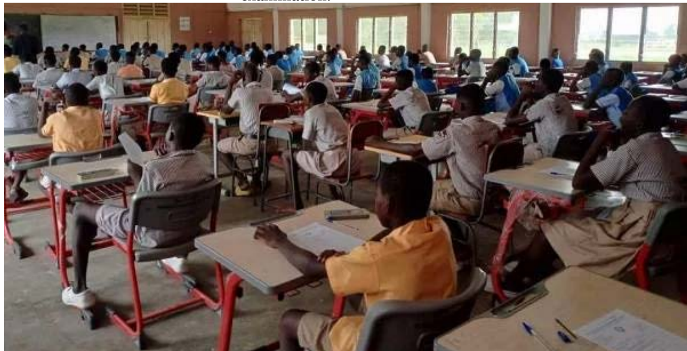
BECE candidates in the exam hall

He added that no incidents had been recorded across the three centres during his visit and advised candidates to remain calm, focused, and conduct themselves independently, encouraging them to approach the examination as they would normal classroom work.