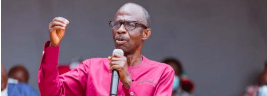
National Chairman of NDC, Johnson Asiedu Nketiah

The National Chairman of the National Democratic Congress, Johnson Asiedu Nketiah, has praised grassroots members of the party for their decisive role in securing victory in the 2024 general election.