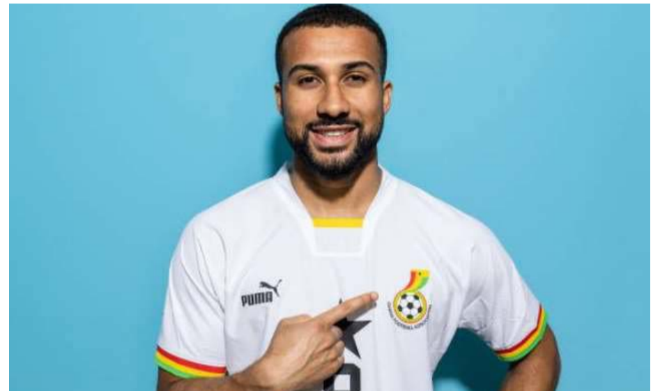
Ghana midfielder Daniel Kofi Kyereh

to be in contention for a place in Ghana’s squad ahead of the 2026 World Cup.