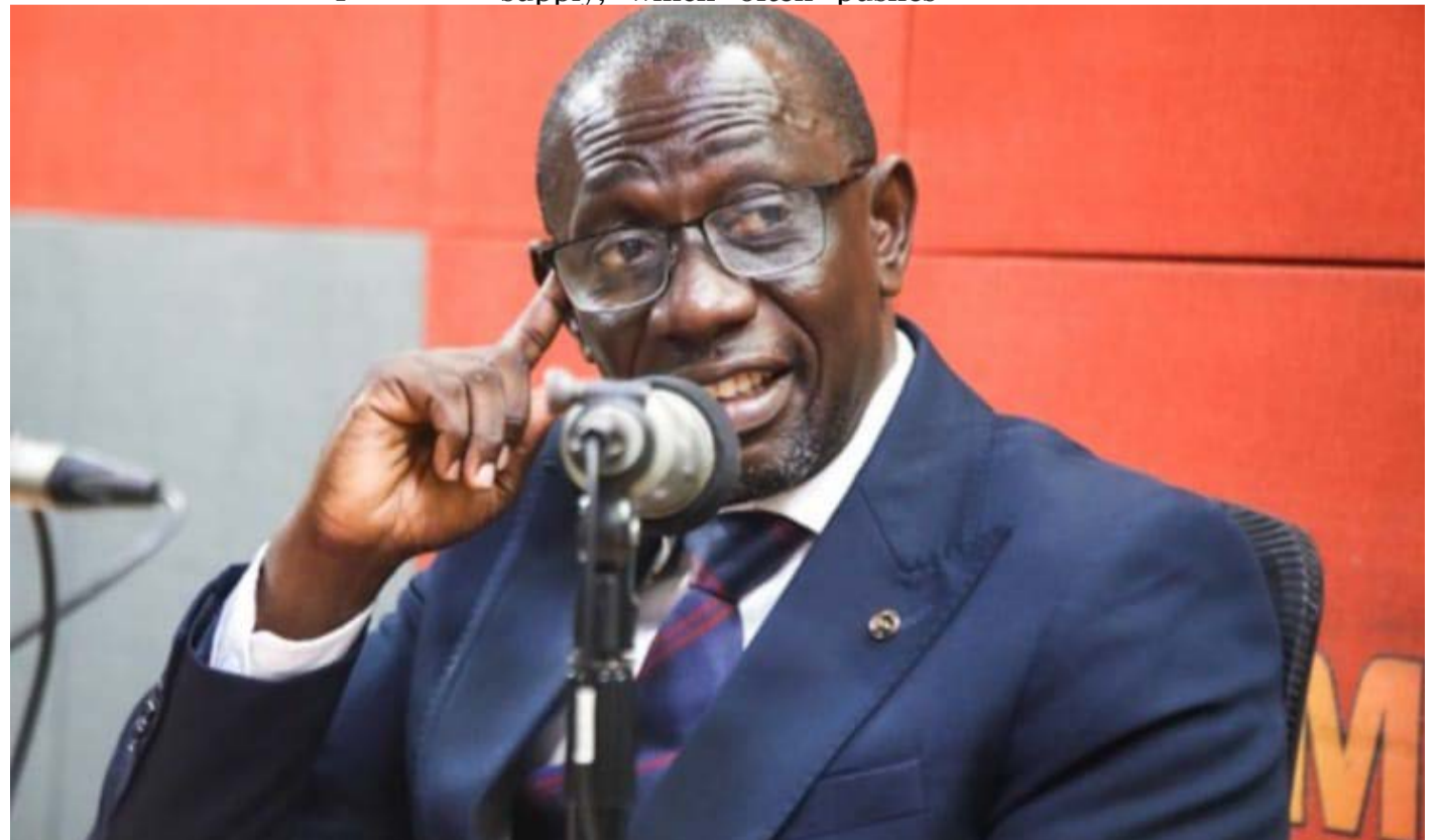
Acting Rent Commissioner, Frederick Opoku

Despite these challenges, the Rent Commissioner stressed that the law remains binding and will be applied accordingly.