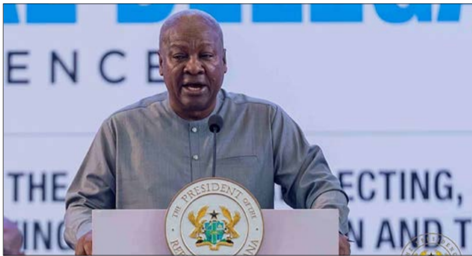
President John Dramani Mahama

President John Dramani Mahama has announced that the government has allocated GH¢500 million in the 2026 Budget to begin the Teachers’ Housing Scheme, also known as the Teacher Dabre Project.