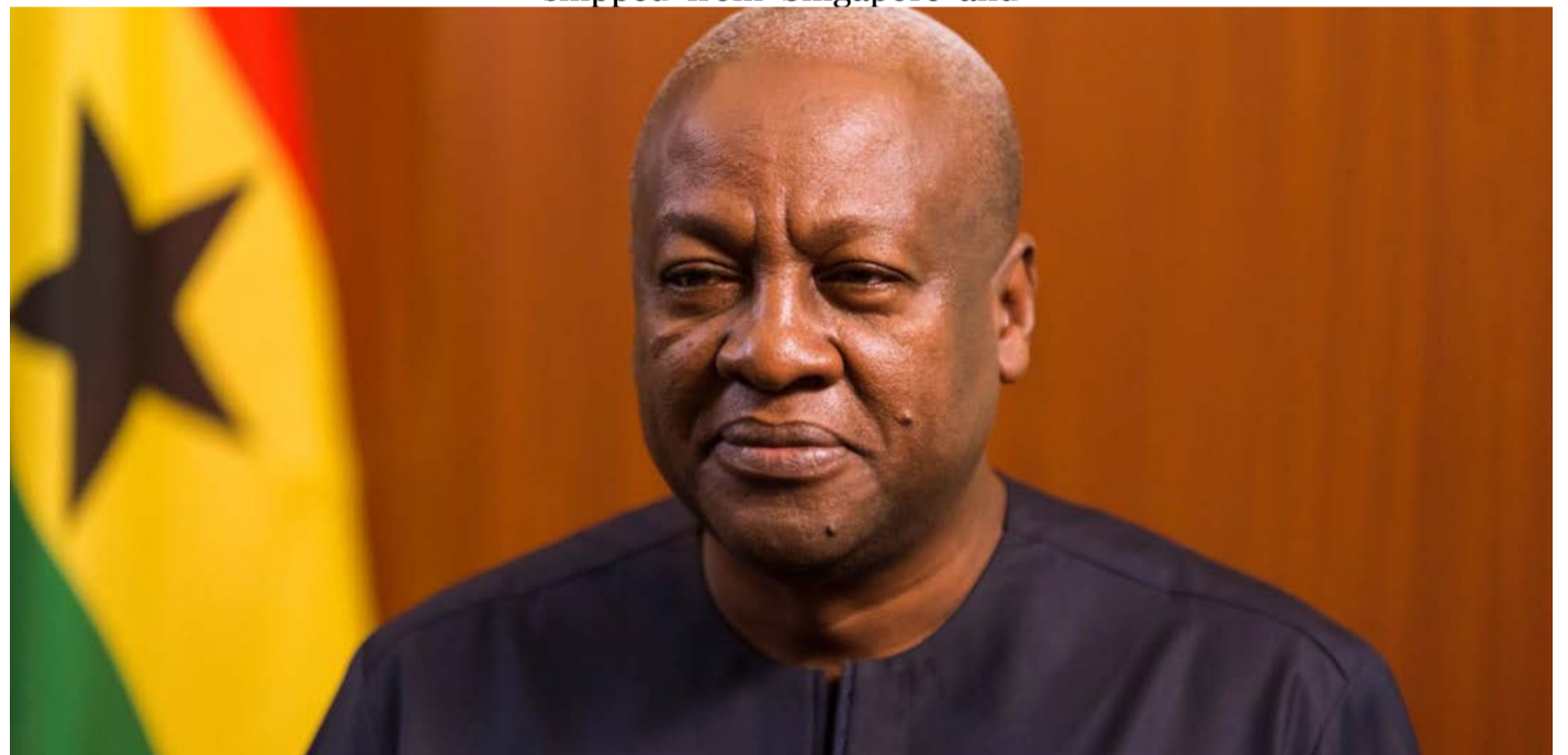
President John Dramani Mahama

President Mahama said the project underscores the government's broader commitment to modernising tertiary institutions and creating a more conducive learning environment for students across the country.