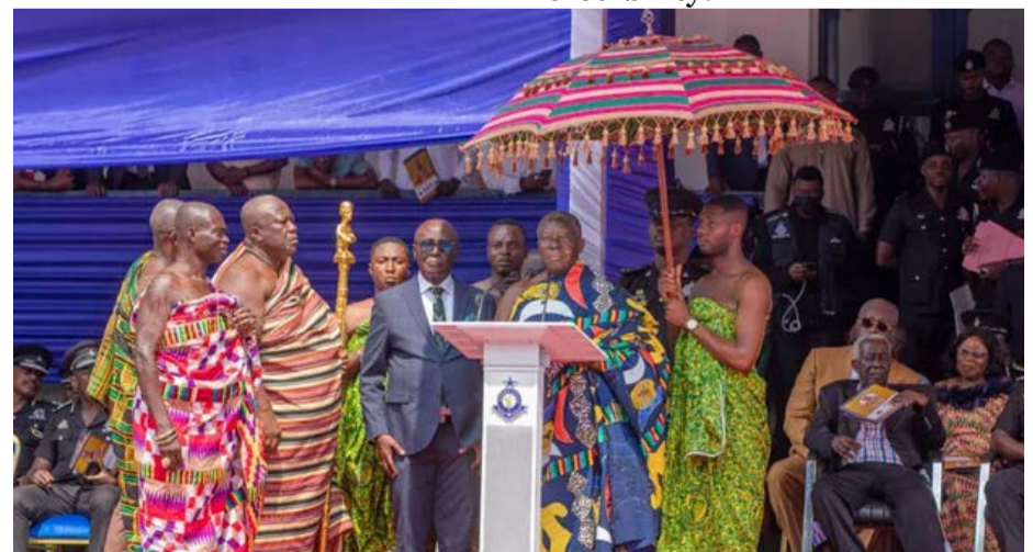
Asantehene, Otumfuo Osei Tutu II presenting his address

His remarks underscored a broader call for reforms that prioritise professionalism and institutional integrity over political influence, as the Ghana Police Service continues efforts to strengthen public trust and operational credibility.