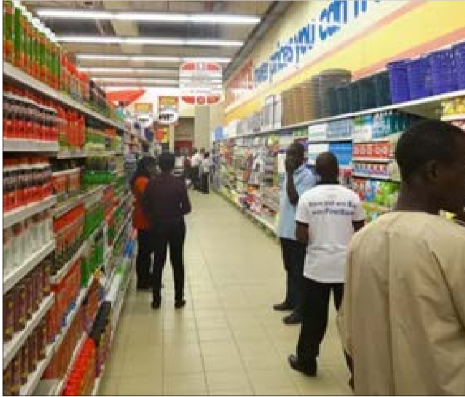
Shoppers at the mall

Shoppers in Accra are beginning to experience modest but welcome price reductions as businesses adjust to recent changes in the Value Added