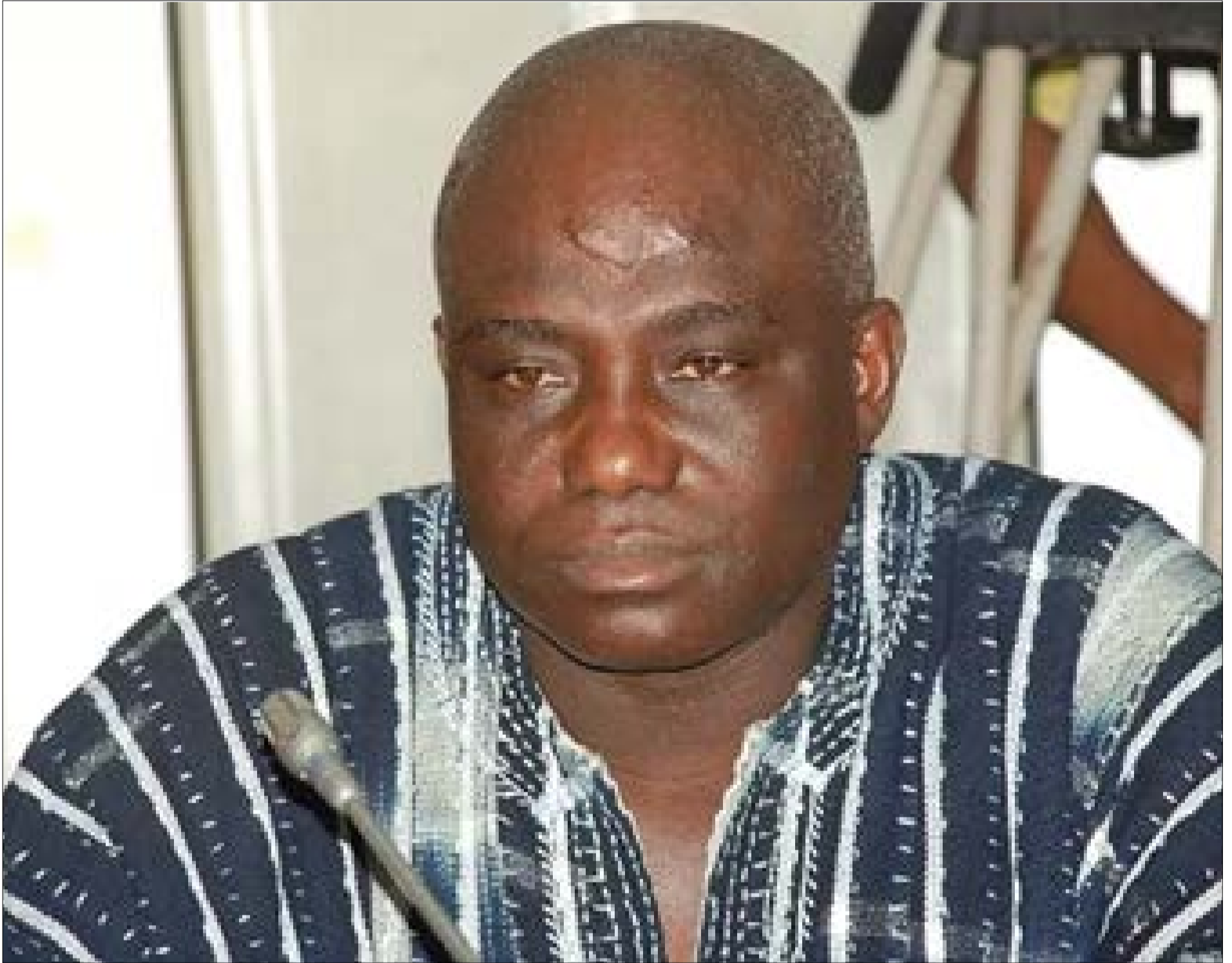
Minister for Food and Agriculture, Eric Opoku

The Minister for Food and Agriculture, Eric Opoku, has revealed that the Precious Minerals Marketing Company (PMMC) suffered losses of approximately 460 million dollars in 2024 during the administration of the New Patriotic Party (NPP).