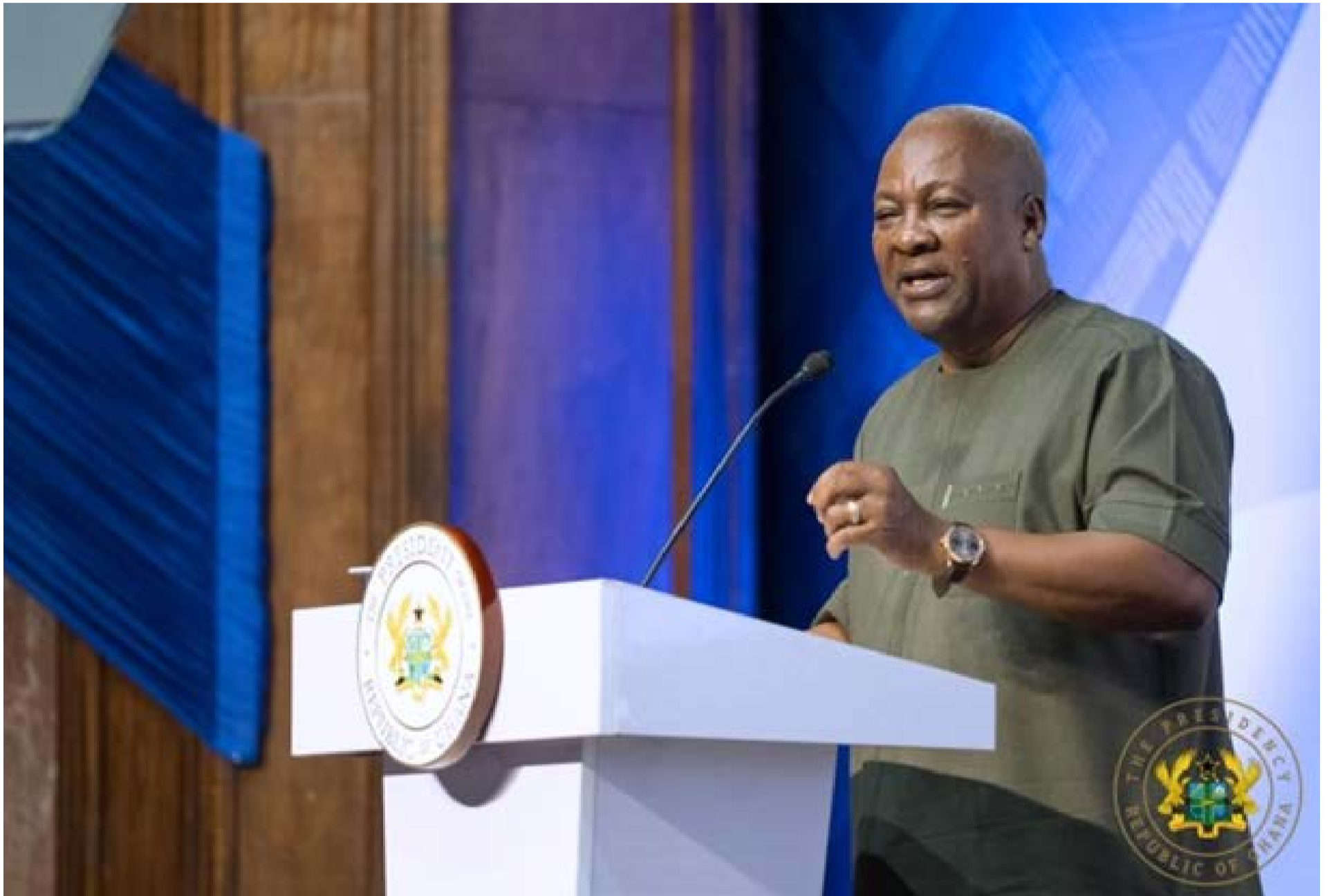
President John Dramani Mahama

P resident John Dramani Mahama has pledged to review the Single Spine Salary Structure and the pensions system as part of efforts to address long-standing concerns of public sector workers in Ghana.