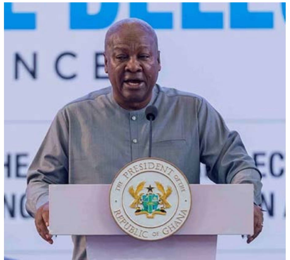
President John Dramani Mahama

efforts to safeguard economic stability.