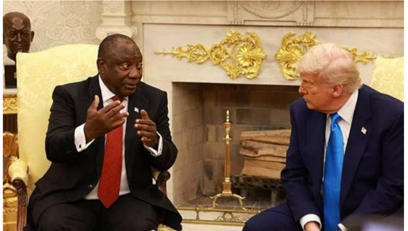
Cyril Ramaphosa (left) and Donald Trump (right)

“We reject utterly the actions that the United States has embarked upon and stand with the people of Venezuela, and we demand the release of President Maduro and